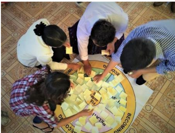
Image 4 - Participants work on the "Wheel of Life's" five dimensions Having, Doing, Knowing, Relating and Becoming

Additional reasons why P-FIM addresses central needs of aid agencies concern the efficiency of the work. Applying P-FIM allows for the recognition and integration of the communities' own actions and assets, which risks being left out of externally planned interventions. P-FIM can help in saving time as there is no need to design an additional strategy for ownership because the community already owns the activity, and resources are spent more efficiently (evaluation questions 1 b).