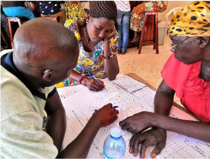
Image 7 – Communities discuss in a goal-free exercise and share the important statements of their lives without agency or programme bias. The goal-free report format is then filled by the teams after the exercise. It records impact statements combining quantitative (important issues in community life) and qualitative (how they relate to those issues) in one report.

The method has successfully addressed the challenge of structuring and visualising the consistently rich outcomes of the exercises. The P-FIM toolkit for example offers a reporting format for the fieldwork and gives step-by-step guidance on how to present the findings from an exercise in a clear and concise way. 16