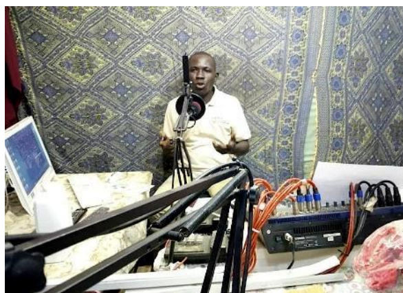
Image 5 – Recording of a radio spot based on jointly developed messages with affected communities

It was until they were listened to, and joint messages were developed with the community that awareness of Ebola and methods of protection could reach the people. A joint community and MI communication plan was prepared. People from the community spread the message, and rumours started to diminish. Trust was built, people had ownership of their situation and were actively involved in the Ebola control. New rumours were identified, discussed and responded to immediately. People consulted Malteser International with confidence to get up-to-date information about the disease.