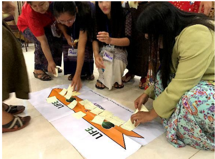
Image 1 – Participants of a P-FIM exercise in Myanmar reflect on their lives, families and communities to fill a Life-Project-Life Diagram. We often think that our projects are a large part of the life of a community. There are many actors who influence community life and our project is often only a small part of the life and context of a community.

working approaches that focus primarily on needs and gaps.