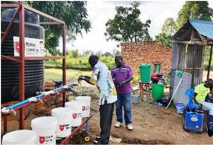
Image 6 - Handwashing Station in Ariwara, DR Congo as part of Ebola Response

Once the community was engaged, they were also open to welcome UNICEF, MSF, OIM and PMA to support the response. “Once we had the confidence of the community, there were no more obstacles to the response.” said the community leaders.