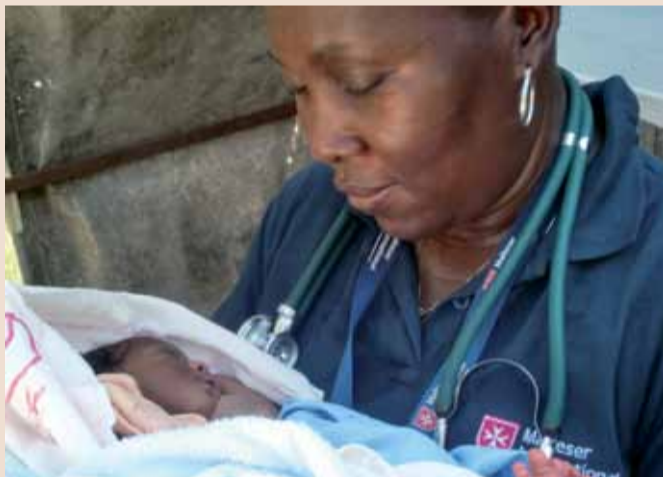
Gleams of hope: Malteser International is also assisting at births.