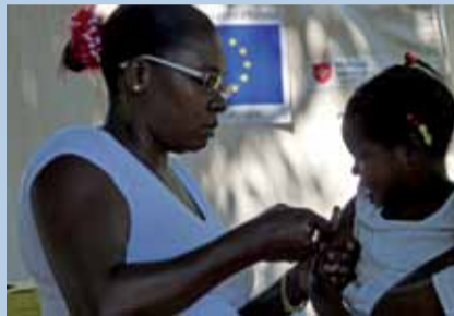
Immunisation campaigns for children