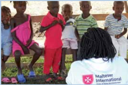
Health and hygiene education

Capacity building is important to improve the health care system in a sustainable way. Malteser International supports the education and training of community health workers and midwives, in close cooperation with the local government health authorities.