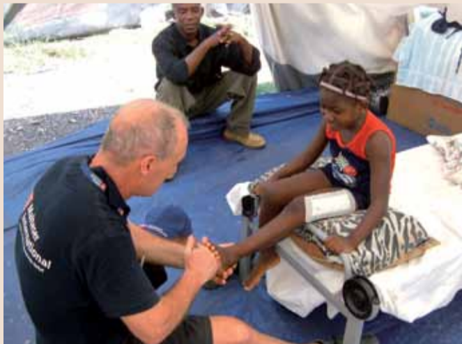
Medical treatment of injured Haitians

“You did not hesitate for a single moment to help us and you saved the lives of many of our brothers and sisters thanks to God's strength. Thank you.”