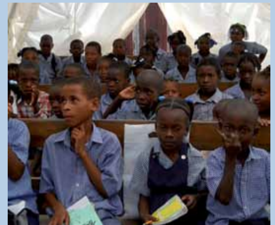
School classes in tents