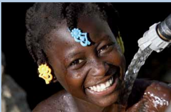
Water is life!

Before the earthquake, Haiti was ranked among the poorest states in the world and struggled with massive problems. In order to support the people of Haiti to live a better life in a sustainable way, Malteser International not only provides immediate emergency relief but also engages in long-term development initiatives, as well as in reconstruction and rehabilitation. A crucial component is to follow a prevention strategy, because it can save lives. Measures of disaster preparedness and disaster risk reduction, especially for the vulnerable and poor groups of the population, provide better protection for the future and enable people to help themselves by their own efforts.