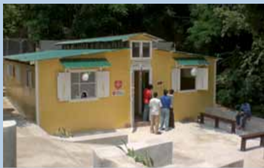
Reconstruction of a health centre in Canapé Vert