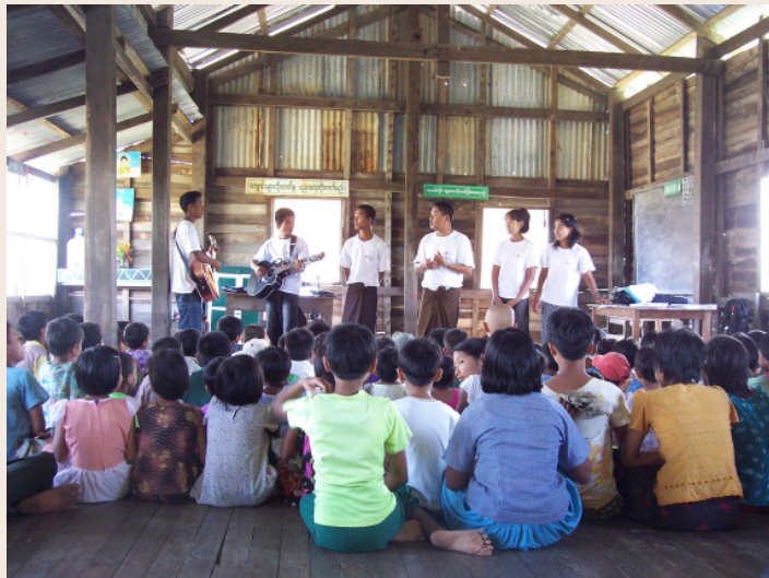
Health education for school children in Myanmar.