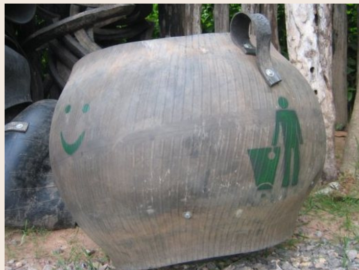
A litter bin in Cambodia: Waste management as key to a more hygienic environment in Asian cities.

Malteser International runs projects related to water, sanitation and hygiene in Cambodia, India, Indonesia, Myanmar, Sri Lanka, Thailand and Vietnam.