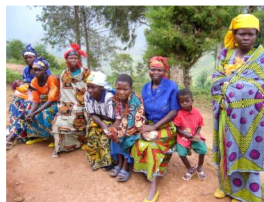
DR Congo: Women waiting in front of a health centre.

having supported the health system for the fight against meningitis, Malteser International is now implementing a project for the fight against the plague. In September 2007, Malteser International also started to support the trauma centre of Kaniola to assist and cure victims of sexual violence in addition to similar programmes already provided in South Kivu and Ituri.