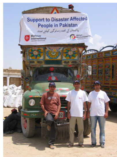
Trucks with relief goods are sent to the flooded areas.

In May 2007, Malteser International completed its winterisation project with mobile clinics for mountain villagers in Kohistan. Within the same project area, a total of nine drinking water facilities have been rehabilitated and improved. Moreover, the organisation responded to the severe floods in June 2007 with the distribution of relief goods and medicine and the implementation of trainings on hygiene in order to prevent the outbreak of infectious diseases.