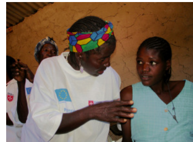
Angola: Personal contacts and advise are crucial for the success of medical programmes.

Since the end of the 27 year long civil war, Malteser International has been assisting the people in the