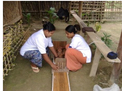
Myanmar: A child is measured to control his health situation.

In 2007, Malteser International started a new project on the treatment and containment of tuberculosis (TB) in Rakhine State and Yangon Division. It aims at countervailing the spread of the infectious disease by medication, distribution of food stuffs as well as direct and regular supervision of the patients by health workers. The project accompanies a TB programme run in Myanmar already since 2003. Furthermore, special emphasis is put on the treatment of malaria and dengue, the provision of safe drinking water and measures to improve environmental sanitation.