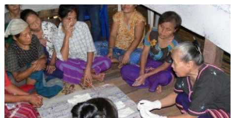
Thailand: Health education in a refugee camp in Thailand on the border with Myanmar.

Malteser International continues its primary health care project for more than 35,000 refugees from Myanmar in two camps situated in the northwest of Thailand. In this region,