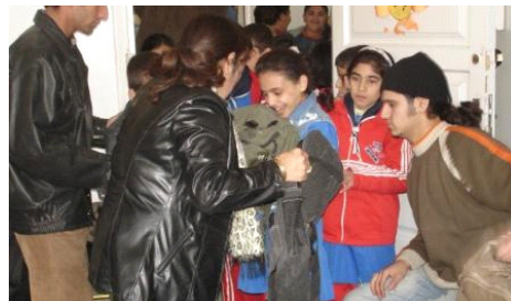
Syria: New refugees from Iraq receiving their “start-up kits”.

Aid for 1,000 people Malteser International has worked in Syria since 2007. Donor: ADH