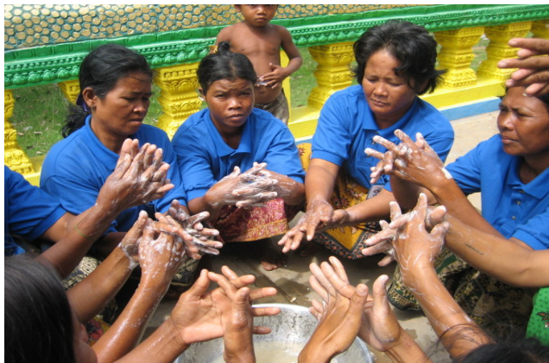
Cambodia: Hygiene training for traditional birth attendants.