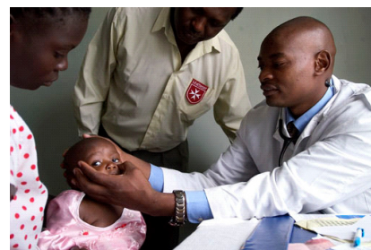
Kenya: A child is examined in a health centre in Nairobi.

2006 and 2007. The “Kenya Association for the Prevention of TB and Lung Diseases” and the Kenyan National Leprosy and Tuberculosis Programme appreciated the important work of Malteser International to the control of tuberculosis. After the severe flooding in September 2007, the organisation distributed mosquito nets, water cans, mobile latrines, hygiene articles and blankets to flood victims in Budalangi.