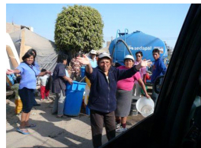
Peru: People waiting for help in Pisco.

When a severe earthquake hit the country in August 2007, the Peruvian Association of the Order of Malta and numerous volunteers of Malteser Peru distributed relief supplies to the victims. Three doctors and two paramedics of the Association provided first aid for the wounded. The international network of the Order of Malta and Malteser International provided 120,000 US dollars to realise further relief programmes. The money is employed in transitional and rehabilitation projects like soup kitchens and a bakery. 40 houses reconstructed with the help of Malteser Peru volunteers could be handed over to families in Cañete. Emphasis has also been put on the improvement of the nutrition of children and elderly people.