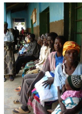
Sudan: Patients waiting in front of a health care centre supported by Malteser International.

provide health care services to the population in the rural areas despite the difficult security situation.