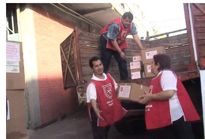
Mexico: Volunteers packing trucks with relief goods.

After the heavy floods in November 2007, the international network of the Order of Malta and Malteser International immediately provided 200,000 US dollars for the victims of the floods in the Mexican state of Tabasco. In Villahermosa, the capital of Tabasco, members of the Mexican Association of the Order of Malta together with volunteers of the local church distributed drinking water, food, hygiene articles and blankets to more than 3,200 people that had fled to the cathedral and to other churches. Hospitals were provided with medicine and medical equipment so that they could treat pregnant women, newborns and wounded people.