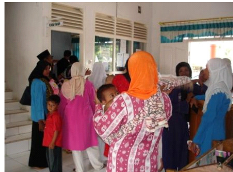
Indonesia: The new health information system will improve the health care provision in Aceh.

International staff: 11 National staff: 48 Aid for 100,000 people Malteser International has worked in Indonesia since January 2005. Donors: ADH, KfW (via GITEC), ZF, Sternstunden