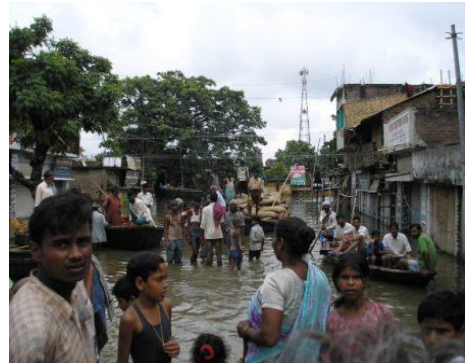
India: People affected by the floods in Bihar.

International staff: 4 National staff: 1 (plus 17 partner organisations) Aid for 1,500,000 people Malteser International has worked in India since 1989. Donors: ADH, BMZ, et al.