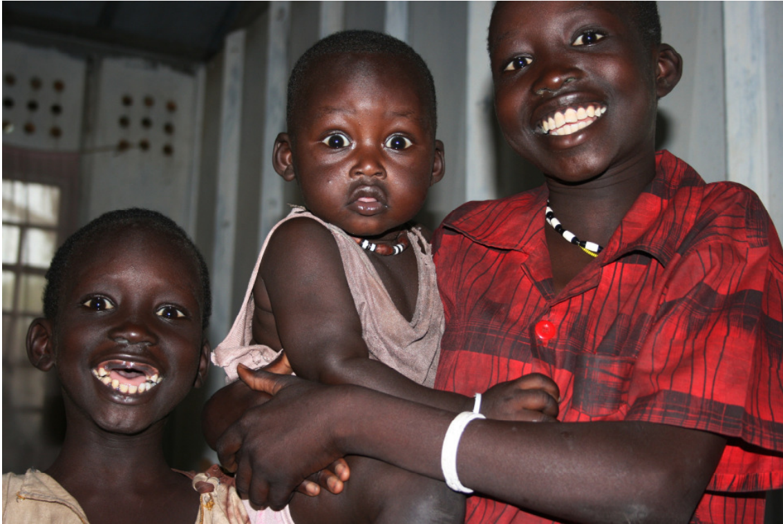
South Sudan: Children waiting for treatment at the Archangelo-Ali-Clinic in Rumbek.

Malteser International – help on the spot – worldwide.