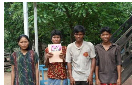
Cambodia: This family proudly presents its insurance membership card.

Meanchey in the northwest of Cambodia. The aim is to improve the health situation in the villages and to reduce poverty by covering the costs for medical treatment. By the end of the pilot phase in October 2007, the CBHI scheme had been implemented in six villages. In 2008, this project will be expanded to the neighbouring province. Other focal points of the work in Cambodia are mother-child-health and health promotion.