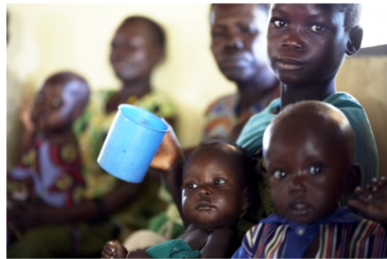
Uganda: The nutrition center in Maracha treats mainly children.