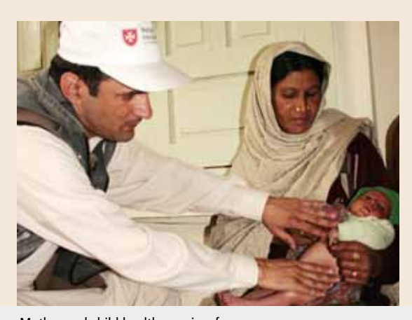
Mother and child health care is a focus of Malteser International's work.

When the internally displaced population returned home after the fighting between militants and army ended, they found many of their health facilities out of use and in terrible condition. To meet this demand, Malteser International rehabilitated and partly reconstructed two Basic Health Units and one Civil Dispensary in the Swat District. The new facilities provide more comfort to female patients, as they include separate waiting and treatment rooms. Furthermore, there will be new space for the training of the community-based Lady Health Workers.