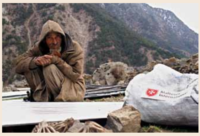
Winter relief in Kohistan 2006: An old man shows the shelter kit he just received.

After the emergency relief, early recovery measures restore people's livelihood by rebuilding not only the material, but also the social infrastructure. In the Swat District, an early recovery project with the local partner organisation Lasoona rebuilt infrastructure that protects residential areas and rehabilitated farmland through a "cash for work" programme. Furthermore, four primary schools are being rehabilitated, enlarged and equipped with sanitation facilities.