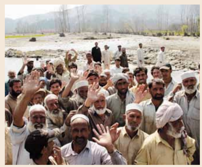
These men were affected by the flood in 2010. In spring 2011, they can draw some income from constructing a retaining wall for their village.

Malteser International is the worldwide relief organisation of the Sovereign Order of Malta for humanitarian aid. The nongovernmental organisation has more than 50 years of experience in humanitarian relief and at present covers around 100 projects in about 20 countries in Africa, Asia and the Americas. Currently, 23 national associations and priories of the Order of Malta are members of Malteser International. Malteser International provides aid in all parts of the world without distinction of religion, race or political persuasion. Christian values and the humanitarian principles of impartiality and independence are the foundation of its work. Its mission is not only to provide emergency relief, but also to implement rehabilitation measures and to facilitate the link between emergency relief and sustainable development. Malteser International establishes and promotes primary health care services and seeks to reduce vulnerability and poverty.