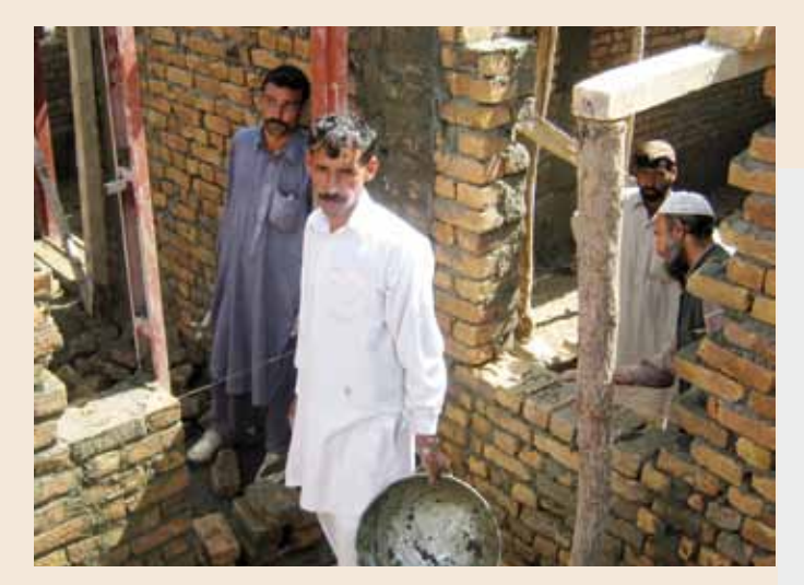
If possible, local workers are employed to reconstruct and rehabilitate health facilities and other social infrastructure projects.