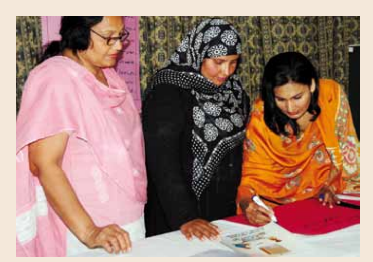
Capacity building for the public health staff, but also for local partner organisations, is an important aspect of Malteser International's work.

Malteser International started its activities in Pakistan after the devastating earthquake of 8 October 2005 in Azad Jammu and Kashmir. Since then, the organisation has responded to natural and manmade emergencies in the country and has focused its reconstruction and rehabilitation efforts on the health sector. Considering the region's highly hazardous environment, disaster risk reduction became a main focus of Malteser International's work in Pakistan. A proper governmental DRR policy was developed only recently (2006) and has not yet been applied to the local communities. Preparedness and prevention do not only save people's lives and belongings, but also save money spent in emergency assistance. Beyond disaster management, Malteser International's Pakistan programme intends to contribute to the capacity building and thus the development of marginalised and vulnerable communities.